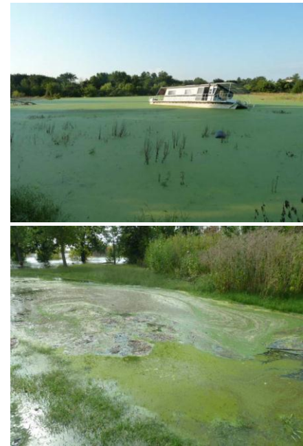
Figure 2 Photos of Algae Bloom at Marion Lake