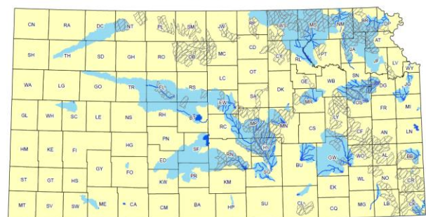
Best Management Practice (BMP) Implementation Areas to Address Nutrients and Sediment

Due to the voluntary nature of the program and the fact that watersheds span multiple counties, the program would be an “on demand” funding mechanism rather than a county allocation approach. The local conservation district would request funding for each project, or group of projects, once they are identified. State agency staff would prioritize and respond to funding requests based on highest nutrient reduction for dollar spent.