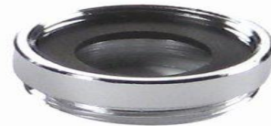
Mark's Plumbing Parts Part #07013