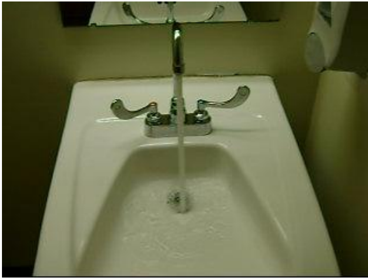
Old 2.2 gpm aerator