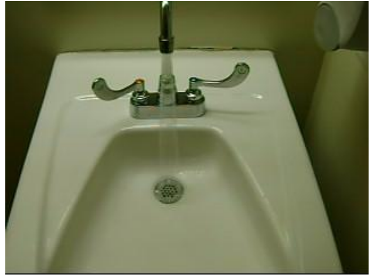
New .5 gpm aerator