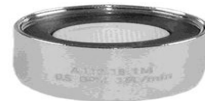
Mark's Plumbing Parts Part #29006